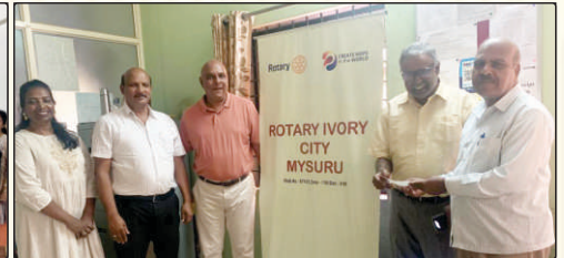
Sponsorship of Dinner to 35 orphan children at Chayadevi Ashram.