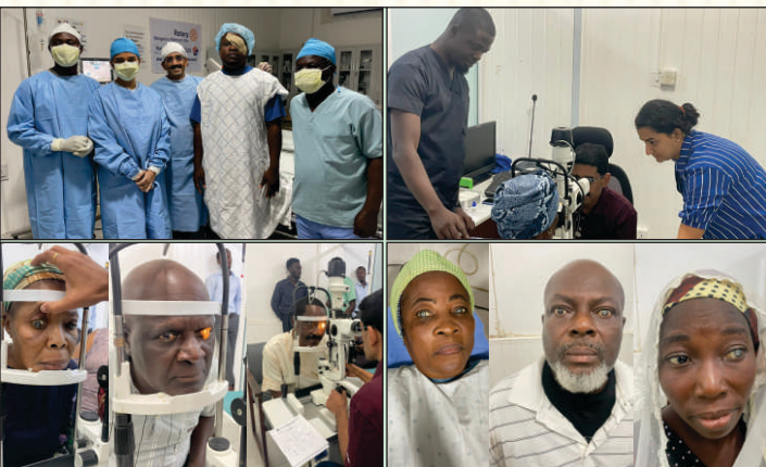
EYE Care service at Ghana, Africa How better to describe our deep involvement on the International front.