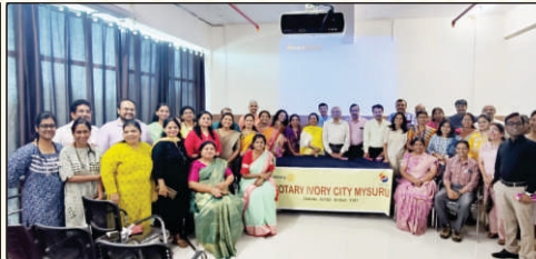
Doctor's Day Celebrations at District Hospital