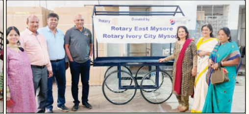
Donation of Vendor Cart A Joint Project with RC East