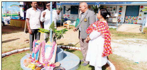
National Flag hoisting on Independence day