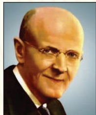
Paul Harris Founder