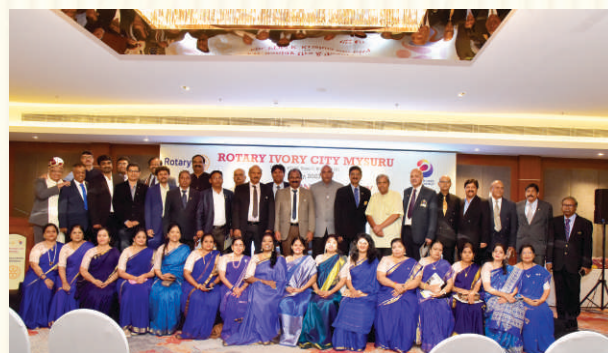
Team Ivory City at its colorful best