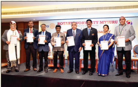
Vol 1 of our Quarterly Bulletin 'TUSKER' being released during the Installation ceremony