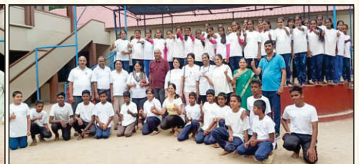
International Yoga day at Vanitha Sadana School