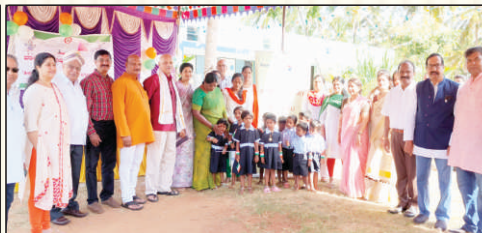
Distribution of uniforms to Anganwadi children