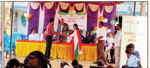
Distribution of Sports Kits to Anganwadi children