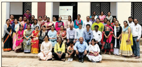
Teachers Training program at Hardwick school