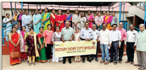
Teachers orientation program at Vanitha Sadana School