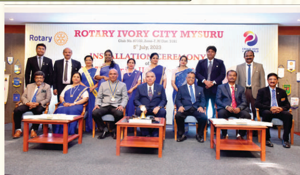
The Board of Directors for 2023-24