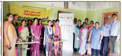
Inauguration of the Rural Tailoring training project at Malehalli, Bannur road