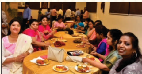
One of our fellowship dinner meets.