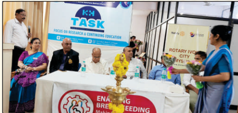
Celebration of World Breast Feeding Week with Kamakshi Hospital.